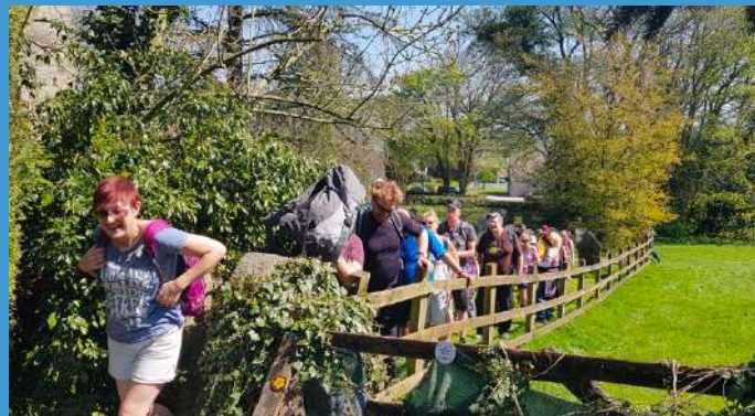
Sports & Walking

Spice Social is the largest social membership organisation in the UK. There's an incredible range of events, weekends away, holidays and much more, focusing on fun and friendship. Feel comfortable coming on your own, knowing that you're in a group of like-minded people. Check now to see what's on in the Manchester Group, which spans Cheshire, Blackburn, Crewe, Oldham, Preston and Stoke