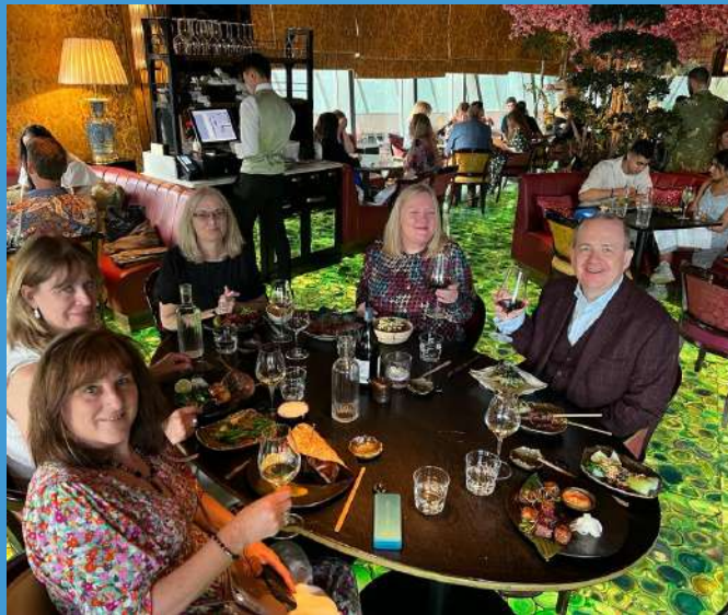
Friendships - local or nationwide

Spice Social is the largest social membership organisation in the UK. There's an incredible range of events, weekends away, holidays and much more, focusing on fun and friendship. Feel comfortable coming on your own, knowing that you're in a group of like-minded people. Check now to see what's on in the Manchester Group, which spans Cheshire, Blackburn, Crewe, Oldham, Preston and Stoke