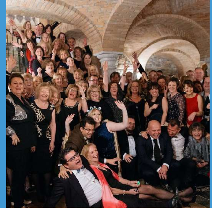
Balls & Parties